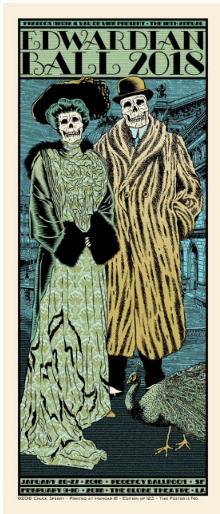
EDWARDIAN BALL 2018 BY CHUCK SPERRY 3 COLORS ON CREAM PAPER, 15" x 35", SIGNED AND NUMBERED $100