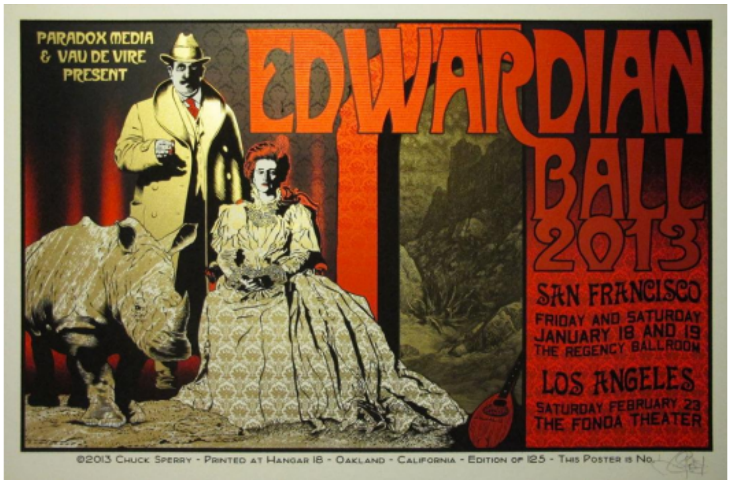
EDWARDIAN BALL 2013 AT THE REGENCY BALLROOM BY CHUCK SPERRY 3 COLORS ON CREAM PAPER, 31' x 20.5", SIGNED AND NUMBERED $100