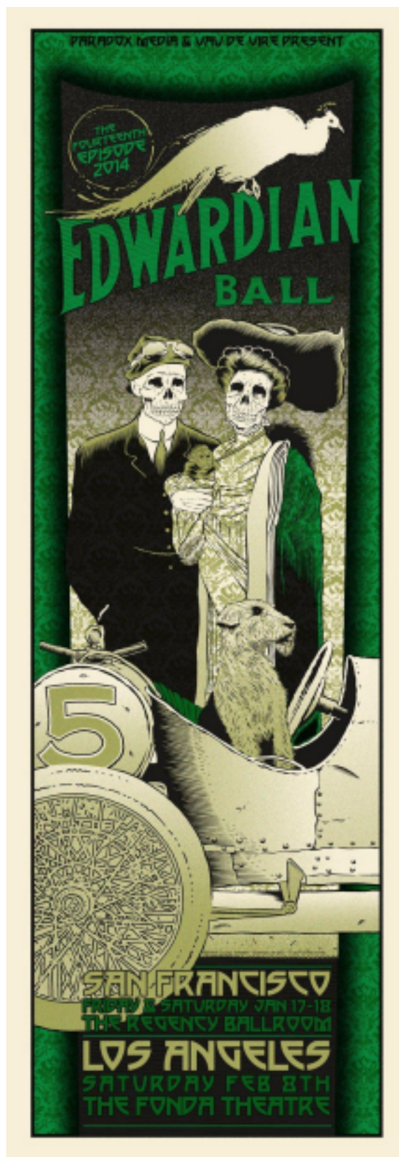
EDWARDIAN BALL 2014 BY CHUCK SPERRY TWO-SHEET SILKSCREEN POSTER, 20" x 58", SIGNED AND NUMBERED $125 DOUBLE PRINT