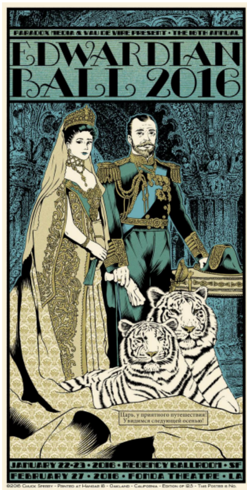
EDWARDIAN BALL 2016 BY CHUCK SPERRY 3 COLORS ON CREAM PAPER, 19" x 35", SIGNED AND NUMBERED SOLD OUT